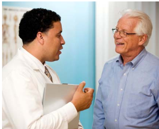
Medical Order for Scope of Treatment

A 'Scope of Treatment' order is an option. You do not have to have one to receive health care services. It does not apply to children.